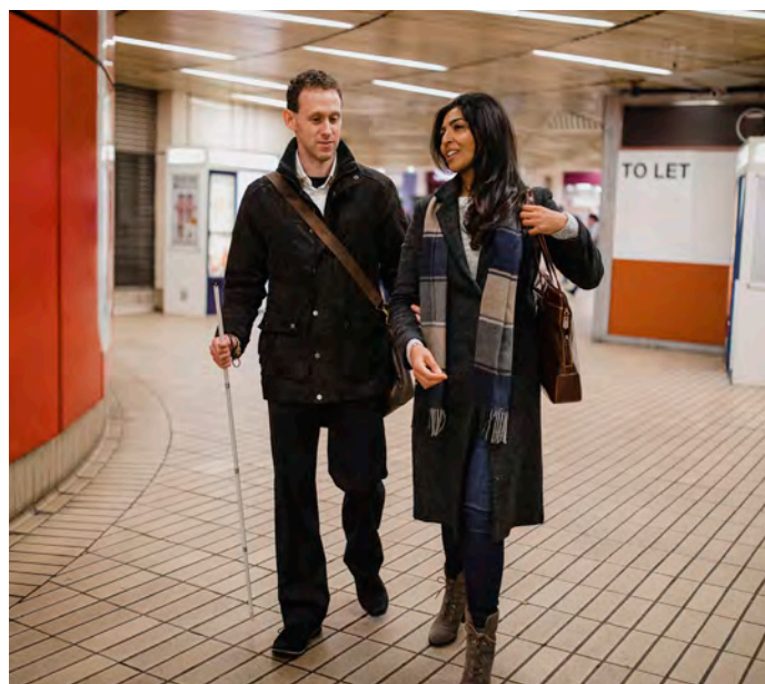
It is important to choose service providers that will help you reach your goals.